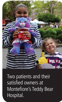
Two patients and their satisfied owners at Montefiore's Teddy Bear Hospital.

In addition to the treatment regimens for their stuffed pals, the children received a tour of the Wakefield Campus Emergency Department, where they learned about essential health information, such as the importance of vaccination, healthy diets, infection control and proper hand washing. The children also had the opportunity to tour an ambulance, complete with free giveaways for the first 400 children. The program's goal is to help children understand the process of visiting an Emergency Department and make them feel more comfortable, decreasing the fear and stress of a hospital visit.