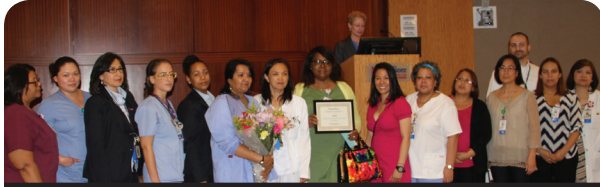
The NW8 team accepts the Team of the Year Award at the 2015 Montefiore Professional Awards ceremony in the Grand Hall, Moses Campus.